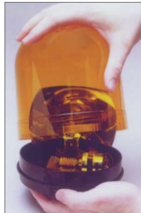
The Sentry features a “twistlock” dome for a sure seal with quick access.

For high vibration applications, an optional vibration mount kit can extend the service life of your Sentry beacon (see accessories and kits).